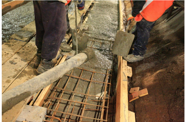
Ready-mix concrete being poured via a static line pump

During Phase one, the work will require the delivery of a significant amount of ready-mix concrete for the foundation work. This concrete will be delivered by road to static line pumps situated in the Marine Parade car parking bays. It is anticipated that approximately six concrete mixer lorries will access Marine Parade per shift with concrete work happening during both low tide windows.